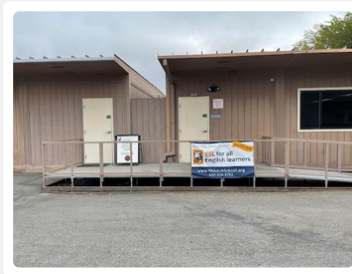
Main Adult School Office at Paly P11